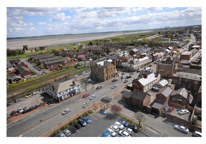
The view from Richard Heights in Flint.