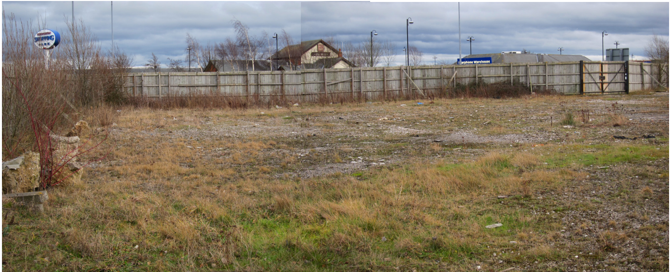
Looking east towards retail park