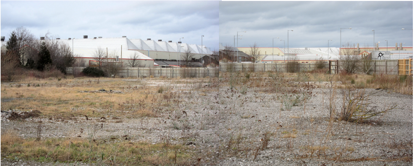
Looking North towards Airbus