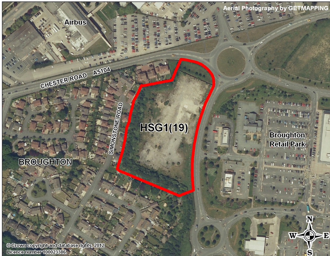
Aerial Photo showing the site

The site comprises approximately 1.8 ha of land and lies between Broughton Retail Park to the east and the residential area of Simonstone Road to the west. It was used as the construction compound during construction of the shopping park, which was a temporary use, and is separated from the existing housing development off Simonstone Road to the west, by a landscaped bund along the western edge of the site which was a condition of the retail park planning permission. The net developable area of the site will be less than this as provision for landscaping and noise mitigation, particularly along the road frontage to the north and east, needs to be incorporated. Part of the existing landscaped bund will also be retained. Overall it is estimated that the area which can be developed for housing excluding this provision will be around 1.6 ha, which at approximately 30 dwelling per hectare could yield in the region of 48 dwellings.