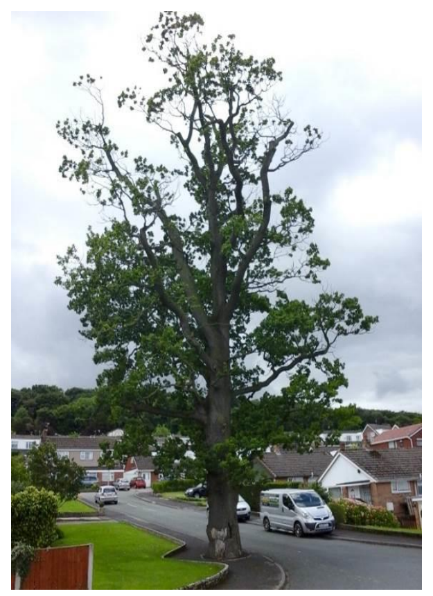
Plate 12. A mature oak in decline subject to frequent inspections

The risk of being killed or injured by a falling tree is frequently exaggerated. This is believed to be due to over reporting of incidents by the media, probably because they are considered to be a freak occurrence and newsworthy<sup>37</sup>. Statistically, the risk of being killed by a falling tree or branch situated in an area of high public use is extremely low<sup>38</sup>.