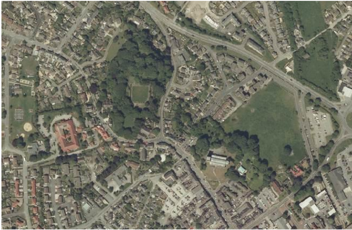
Plate 1. Mold aerial photograph from 2009

A 2016 study<sup>12</sup> published by CNC/NRW looked at urban canopy cover across Wales' towns and cities. Urban canopy cover is classed as the amount and distribution of urban land under tree or woodland cover when assessed using aerial photographs. The study was the first ever country-wide survey of its type in the world and found that the average canopy cover for Wales was 16.3% in 2013 and down from 17.0% in a previous 2009 survey.