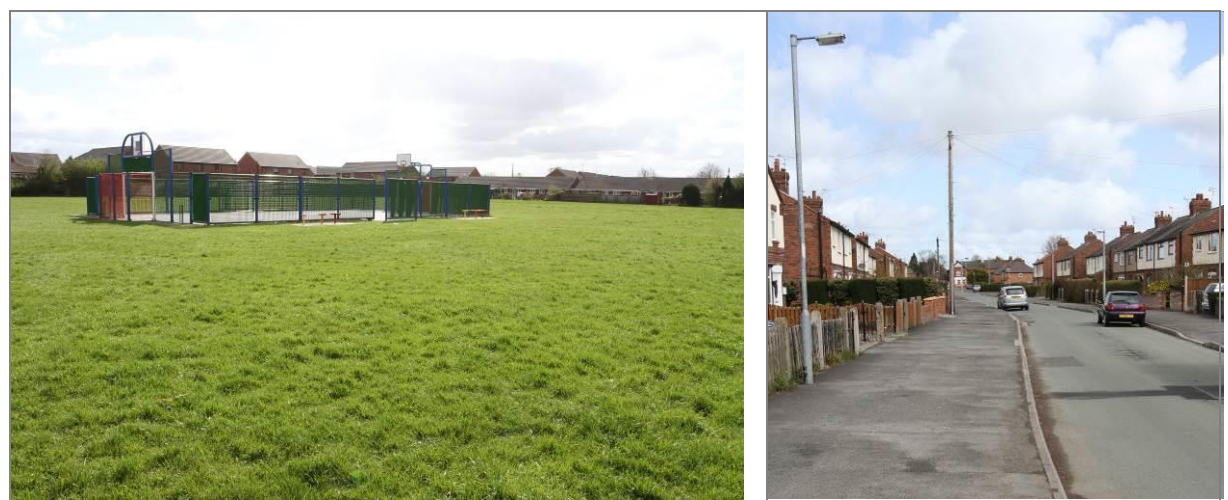
Plate 9. Park Avenue playing field, Saltney