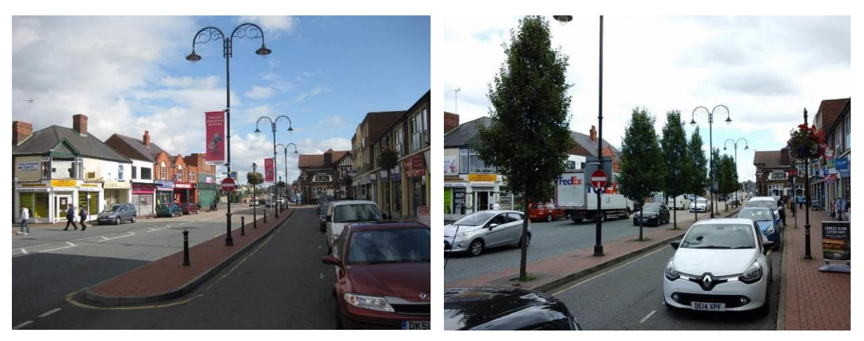
Plate 7 and 8. Flint street tree planting undertaken in 2013 (Before, left and after, right)

When planning and implementing tree planting in hard surfacing best practice guidance within Trees in Hard Landscapes will be followed and the guiding principles of Manual for Streets 2. For successful tree planting to be undertaken in streets it will be necessary to overcome technical issues and objections that have traditionally occurred.