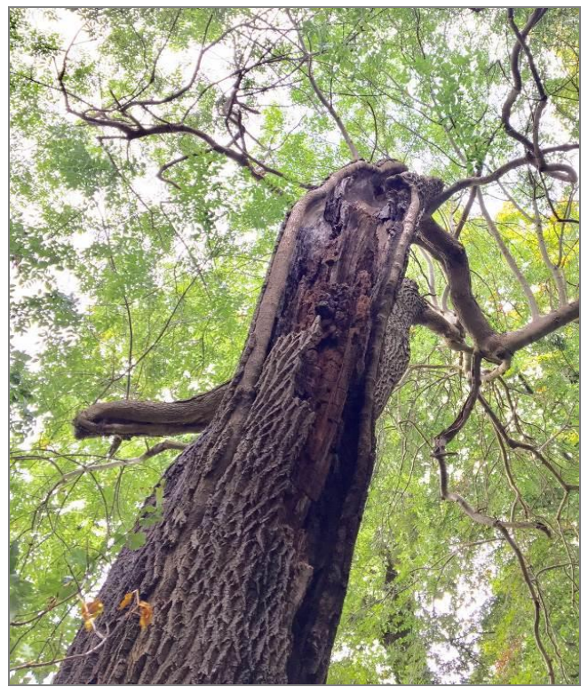
Plate 13 A decaying tree with bat roost potential

Many species of principal importance for the conservation of biological diversity are dependent on, or are associated with trees and woodland. These species include dormice, great crested newts, bats and badgers as well as many species of bird, invertebrate, lichen, moss and liverwort.