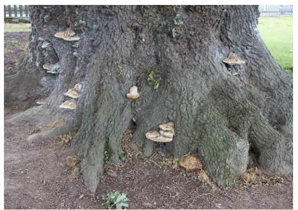
Plate 14. Base of ancient oak at Ysgol Bryn Gwalia