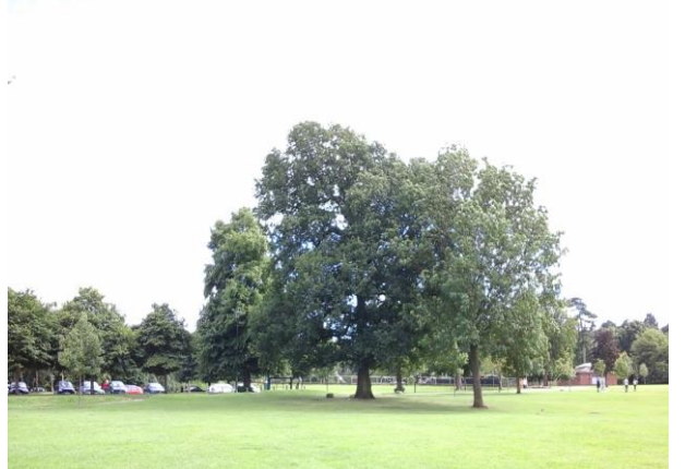
Plate 2. Mature trees and parkland at Wepre categorised as Formal Open Space

To increase biodiversity there is also the opportunity to sow wildflowers adjacent to trees where reduced grass cutting occurs as part of revised open space management.