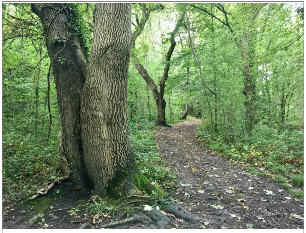
Plate 12. Urban woodland at Wepre Park

The council will protect and enhance its own urban woodlands guided by long term woodland management plans. Management plans will be based upon a policy of continuous cover so that long term canopy cover remains stable or is increased. Felling will only be carried out for overriding safety reasons, to facilitate natural regeneration or carry out new planting. Where felling is considered acceptable it will only be carried out in small woodland compartments or as a thinning operation. In exceptional cases young scrub woodland may be cleared to enhance particularly rare plant communities (e.g. limestone grassland), geological features (e.g. limestone pavement) or ancient monuments.