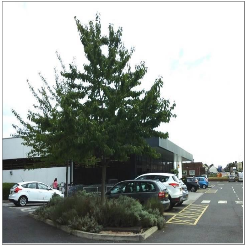
Plate 11. Landscaping in a new retail development, Flint

Policy L1 of the Flintshire Unitary Development Plan is the policy that supports landscaping and states that;