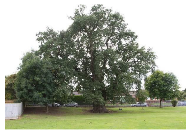
Plate 13. Ancient oak at Ysgol Bryn Gwalia, Mold

Ysgol Bryn Gwalia in Mold has an ancient pedunculate oak growing in the grounds with a trunk girth of 8.30m, the largest known in Flintshire. The oak is the school's emblem and the most accurate estimate of the tree's age using White<sup>53</sup> is 774 years. Despite the oak's great antiquity the tree is remarkably uniform and vigorous and because of this lacks veteran features.