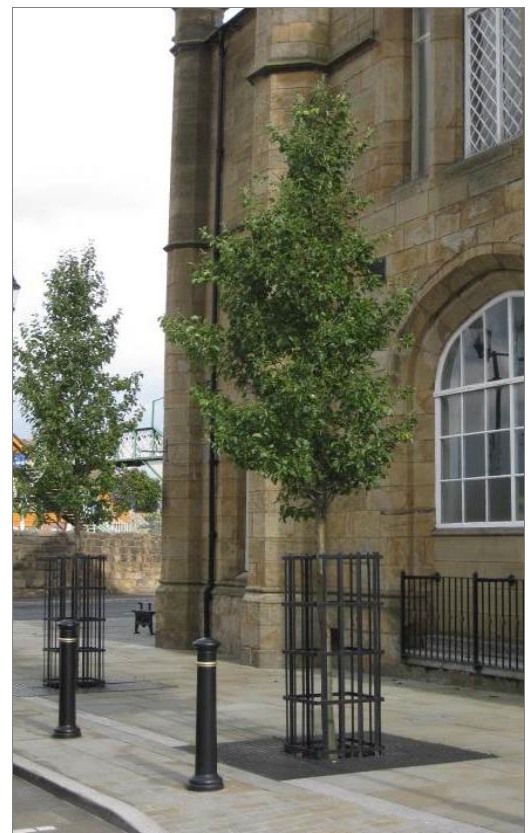
Plate 15. Treegeneration funded tree planting in Flint

The plan seeks to be a key document in securing funding from the Welsh Government under the Sustainable Development Fund and other Welsh Government grants that are expected to become available in the future. Occasionally grant funding for tree planting becomes available at short notice and the plan will be able to identify suitable sites that can be planted 'off the shelf' at short notice.