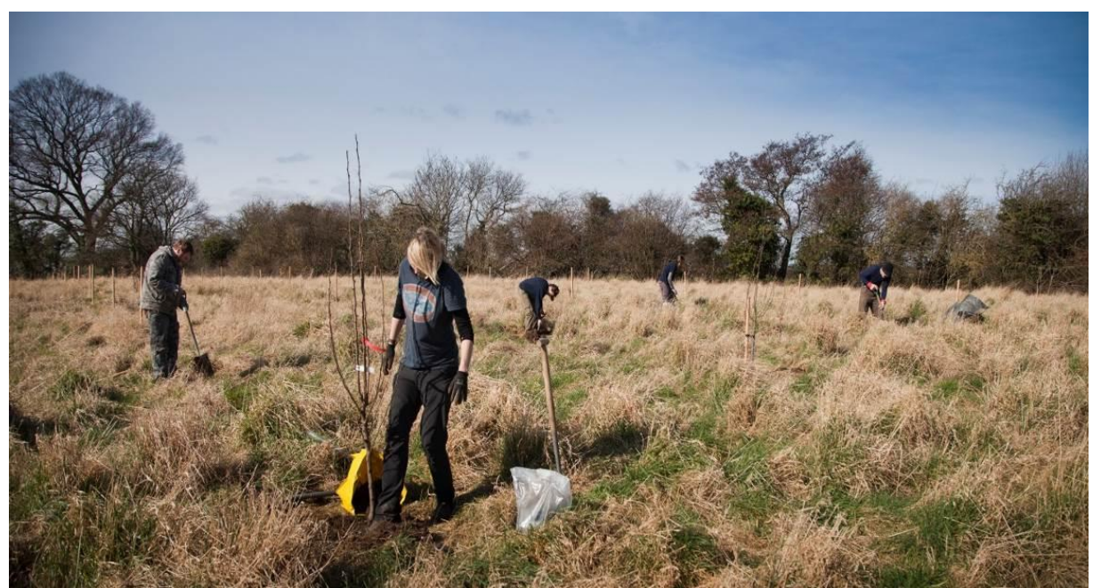
Plate 14. Volunteers planting orchard trees at Llwyni on the edge of Connah's Quay

Partners for the delivery of the plan will include town and community councils, with other partners potentially including Coed Cadw/Woodland Trust. The Countryside Service has already established good working partnerships and manages woodland at Caergwrle Castle on behalf of the community council.