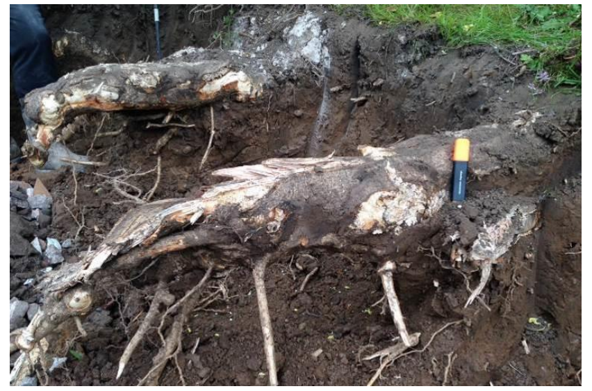
Plate 13. Structural roots severed just below the surface during excavations

Flintshire is a county where the overlying geology comprises of glacial clay, sands and gravels with occasional alluvial sand and gravel deposits in valleys. Due to this geology the consequent overlying soil type is not prone to shrinking when drying out and the potential for tree root related subsidence to occur is low. Notwithstanding, if subsidence is suspected to have been caused by the roots of a council tree any claim made to the council should be supported by technical information (An arboricultural report, structural engineer's report and a period of crack monitoring). Where a tree is proven to have been the main factor causing subsidence remedial action will be undertaken appropriate to all the relevant factors, including amenity and arboricultural best practice.