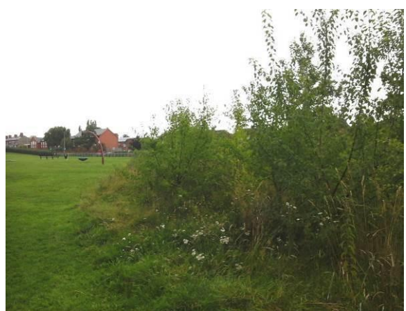
Plate 3. Whip tree planting undertaken at The Willows, Hope categorised as Formal Open Space

To assist with creating a diverse and resilient tree cover less common tree species will be used. These less common species will also provide added interest and will not look out of place in a more formal landscape. Within Formal Open Space there is an over reliance on mature and late mature trees to provide canopy cover and new planting will result in a more varied age structure.