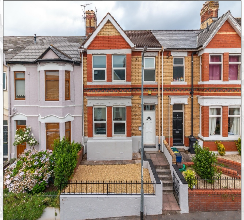
Example of one of our 5-bedroom temporary accommodation properties

At D2 we pride ourselves on being adaptive, proactive, caring and professional. We've been pioneering the way temporary accommodation should be run since 2017, this is why currently 10 Welsh local authorities utilise, respect and value the service we provide.