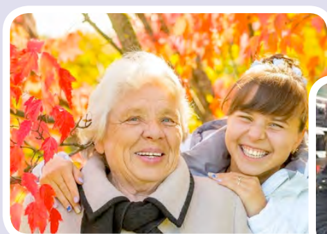
Dementia Friendly Communities