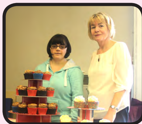
Direct Payments Open Day (March 2015)

We are now also embarking on a new direct payments card scheme, in partnership with APS card solutions, which will administer the funding differently. The initial project went live at the end of February 2015 and will support approximately 30 service users. The project will be reviewed before hopefully being offered to anyone who would benefit from this approach.