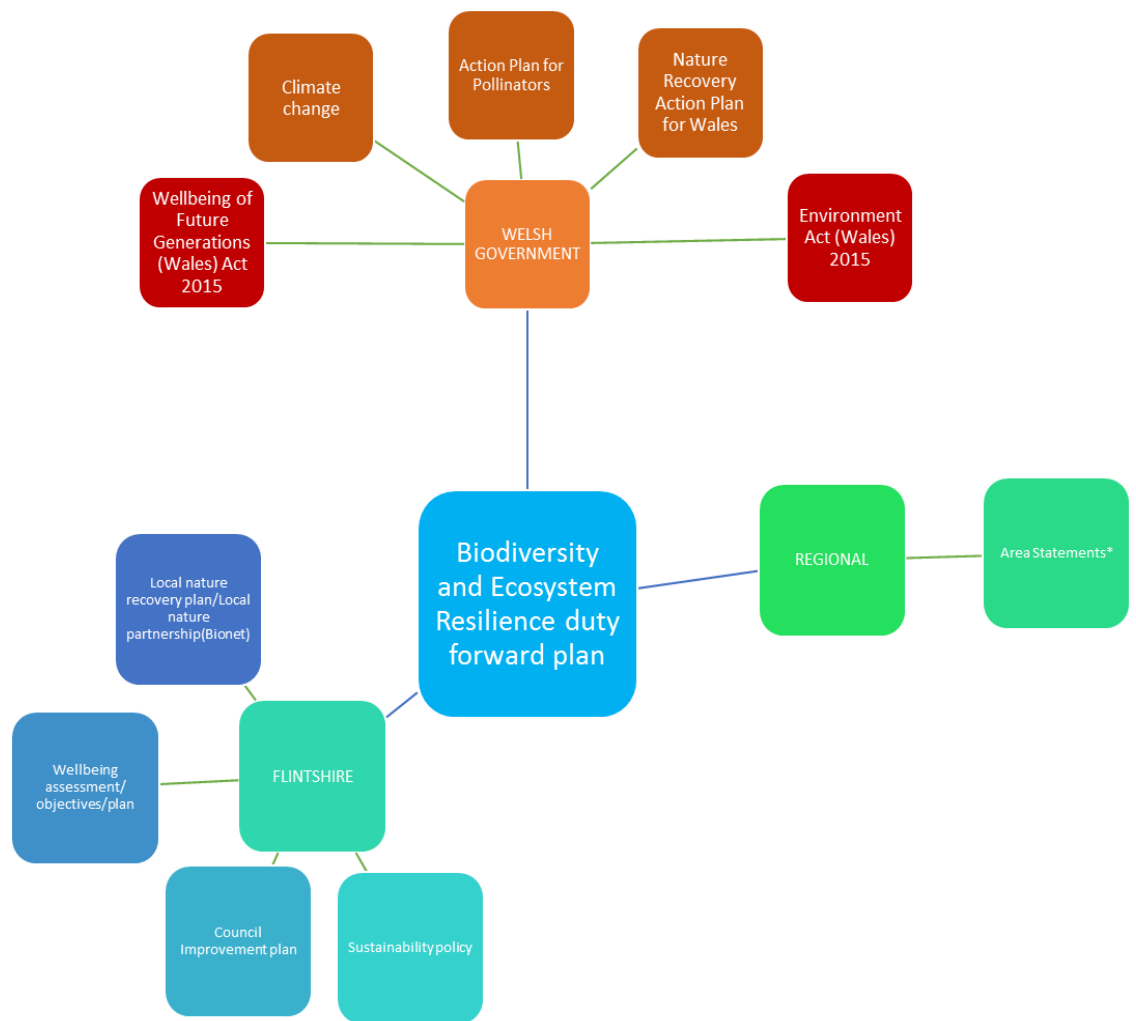
Figure 1: The legislative and policy architecture surrounding the Biodiversity and Ecosystem Resilience Duty delivery plan

*The Areas for area statements are still to be finalised by NRW but we are assuming they will be at a regional scale